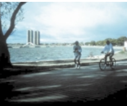
Waterfront Regeneration Trust

6. Monitoring. In order to delist Toronto and Region as an Area of Concern, we need to be able to clearly demonstrate that the beneficial uses specified in the Great Lakes Water Quality Agreement have been fully restored. This report identifies a focussed list of monitoring and research needs for the RAP, which should be addressed by all the agencies participating in the integrated monitoring program developed by the Toronto and Region Conservation Authority.