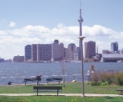
Waterfront Regeneration Trust

Toronto's waterfront and watersheds have been on the "black list" of Areas of Concern around the Great Lakes since 1987. This document reports on the work that has been done since 1987 to restore water quality and healthy habitats. It provides an in-depth assessment of progress, outlines the activities that are underway towards remediation, and establishes clear priorities for removing Toronto from the list of Great Lakes Areas of Concern.